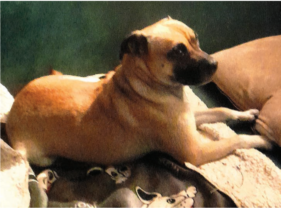
Name: Mr Pickles. Likes: treats and sleep and Dislikes: the lawn mower. Age: 3 ute rides.

Chair Yoga is a gentle and effective way to support your physical and mental wellbeing, especially for those wanting to maintain strength, flexibility, balance, and calmness in a safe and supported way. Practised while seated, Chair Yoga is ideal for older adults or anyone recovering from illness or injury, helping improve mobility, reduce stress, and even support better sleep.