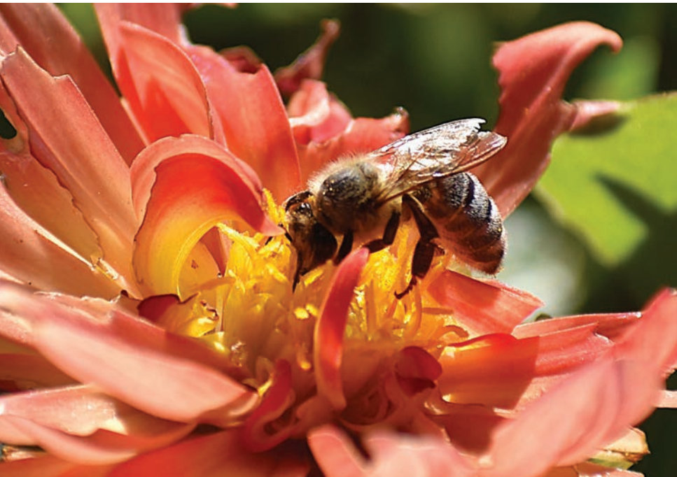
Enjoying the last of the autumn flowers